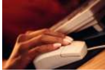
Step 2 Visitor's IP address captured by merchant