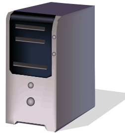
Step 3 IP2Location Web Service (Geographical information retrieval)