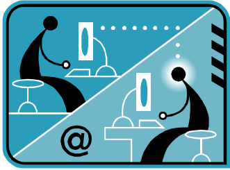
Step 1 Visitors visit websites